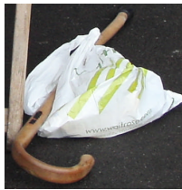
Famous Tour Kit