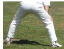
Famous Arse !